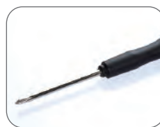
Screw driver included