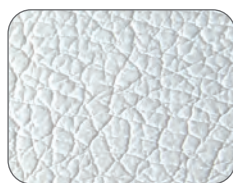
Stylish PU leather