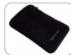
Water resistant carry bag