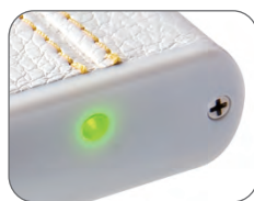
Power & Access indicator