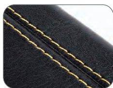
Leather-binding technique (patented)